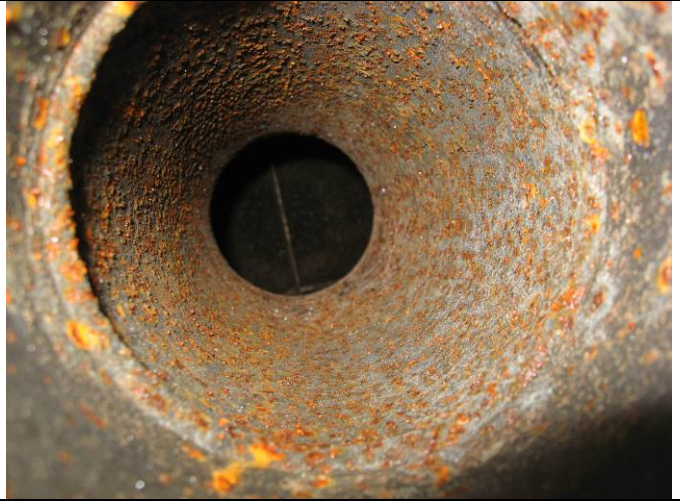
Outlet nozzle – view of mesh pad.