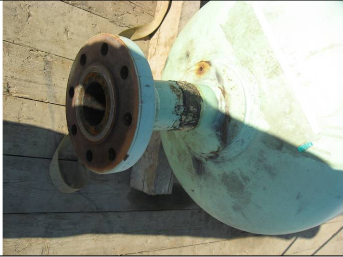
Gas outlet nozzle.