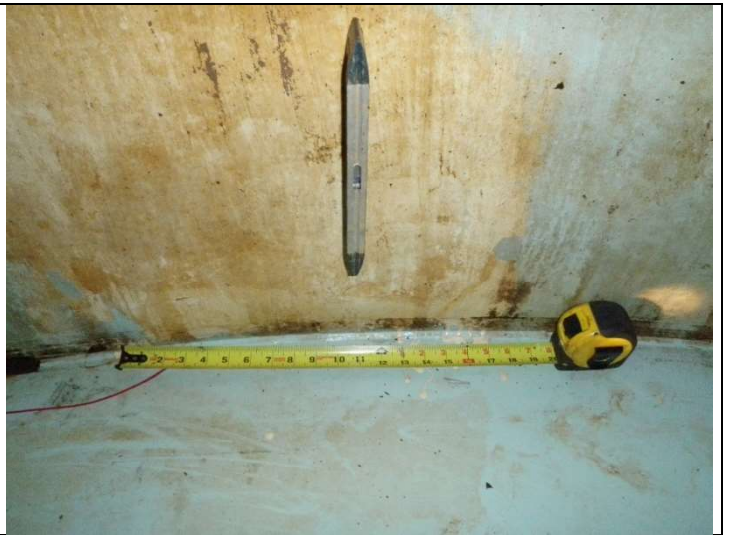
20.0 inches length