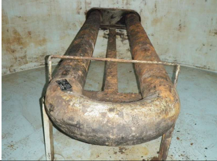
Fire Tube – corrosion/pitting