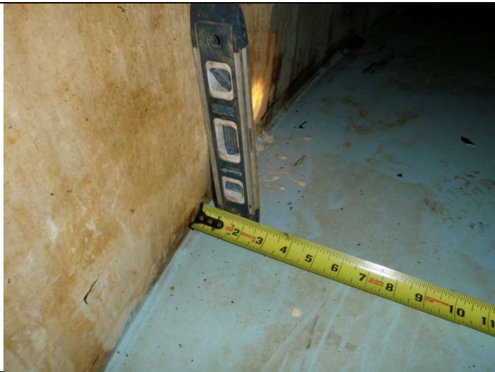
Inward deflection – 0.5 inches