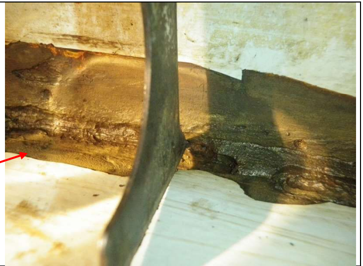
Corrosion/pitting at shell to floor weld