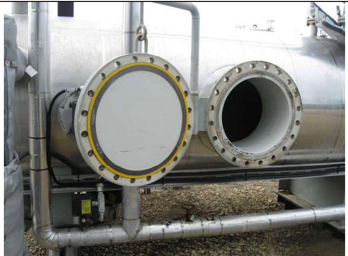
Man way access