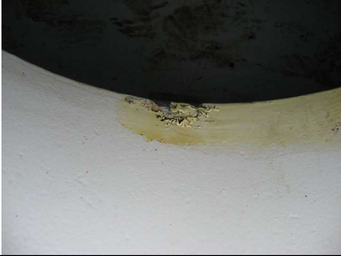
Coating failure at man way access