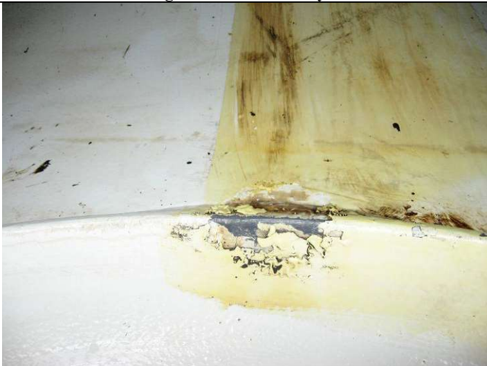
View from internal surface of coating failure