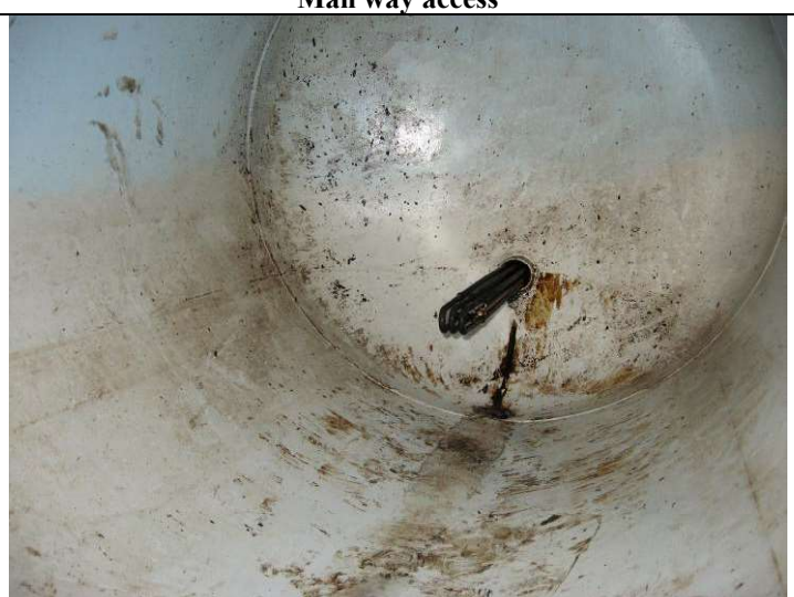
Heat coil in opposite head