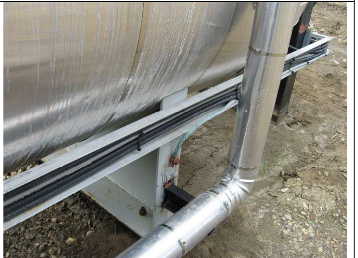
External piping and ground cable