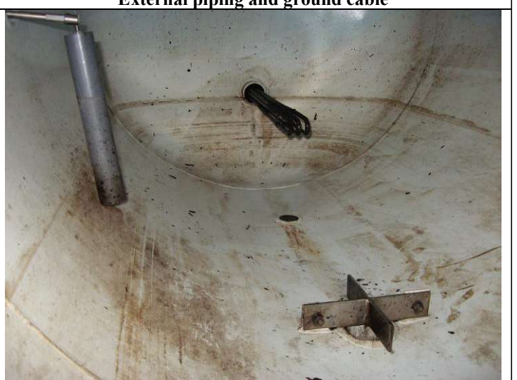
Specific gravity float, heat medium coil and vortex breaker.