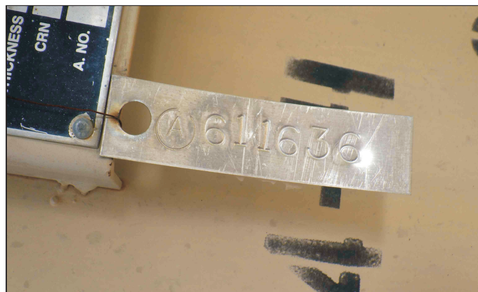
NAMEPLATE / ID