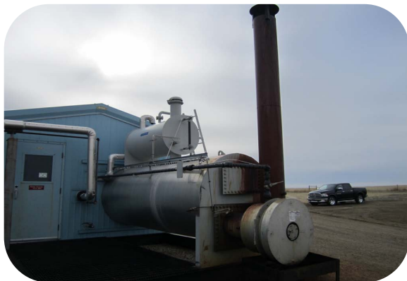
A0438939_West End view_28Mar2012