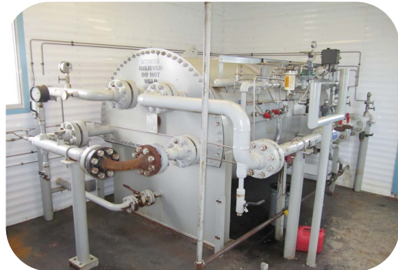
A0438939_Inlet and Outlet piping_28Mar2012