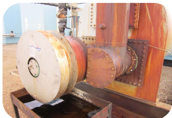
A0438939_Burner and Stack assembly_28Mar2012