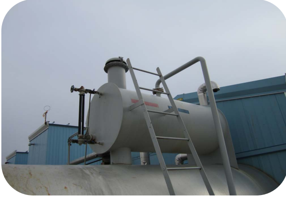
A0438939_50,50 Reservoir tank_28Mar2012