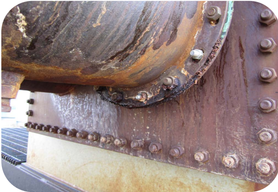
A0438939_Gasket leak on Stack_28Mar2012