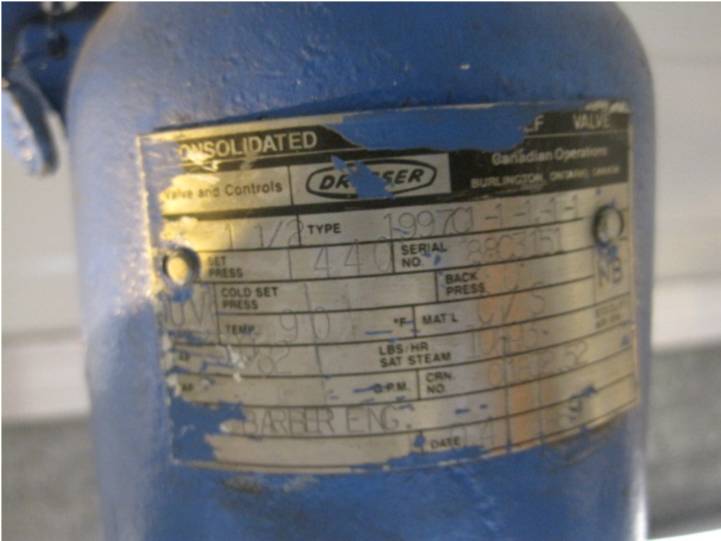
PSV Nameplate 2