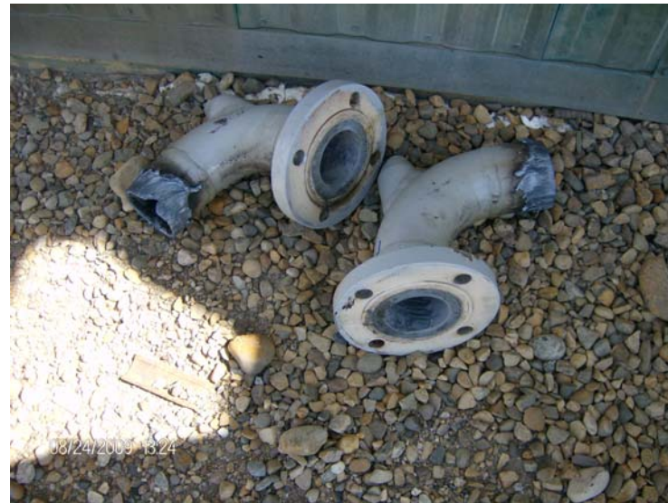
Grand Forks FWKO (A0210632) _ Cut out Nozzles