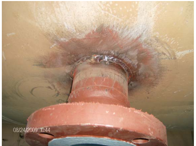
Grand Forks FWKO (A0210632) _ East Nozzle_South View 1 st Pass