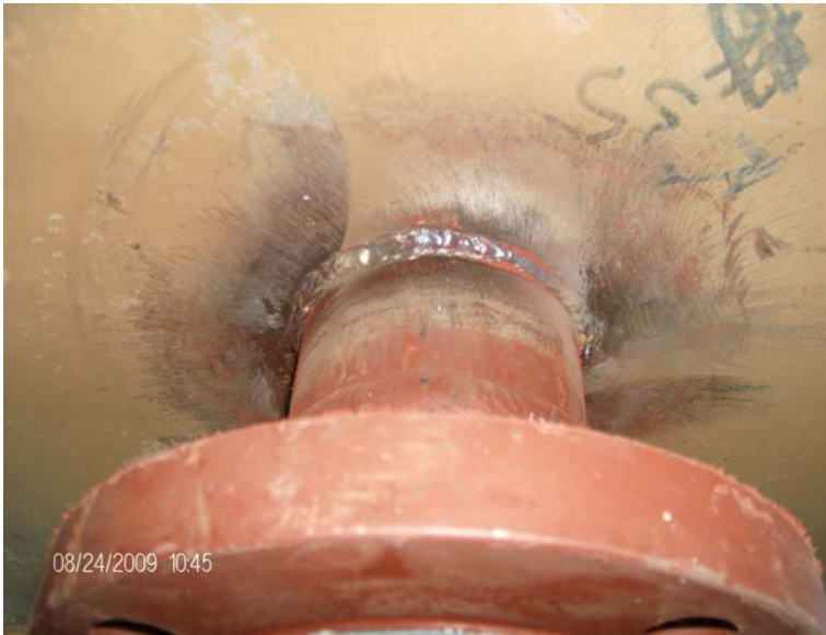
Grand Forks FWKO (A0210632) _ East Nozzle_North View 1 st Pass