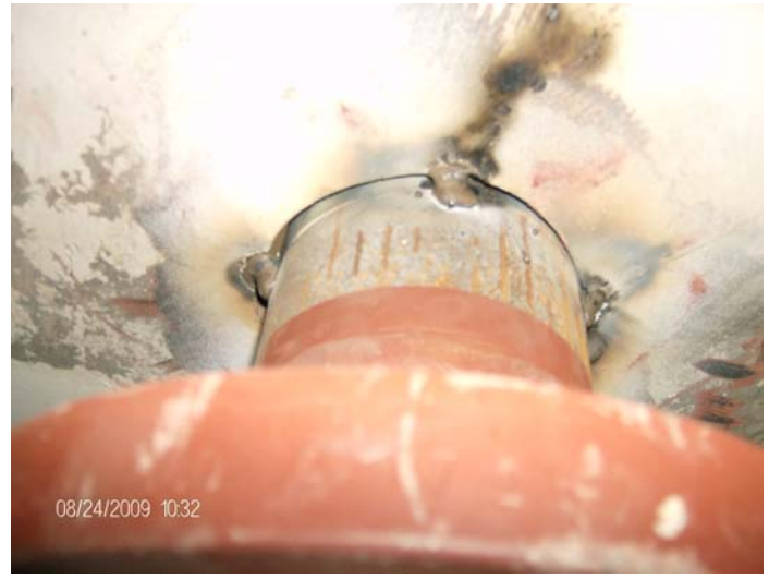
Grand Forks FWKO (A0210632) _ West Nozzle_South View of Tack Weld fit up