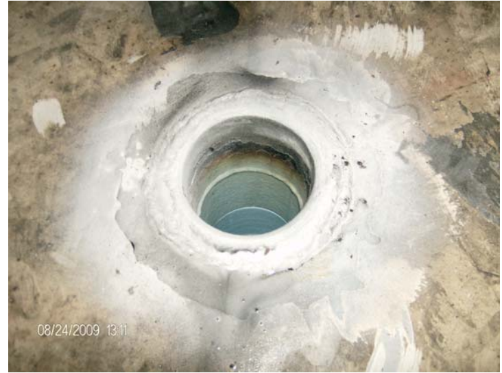
Grand Forks FWKO (A0210632) _ East Nozzle_Final Pass