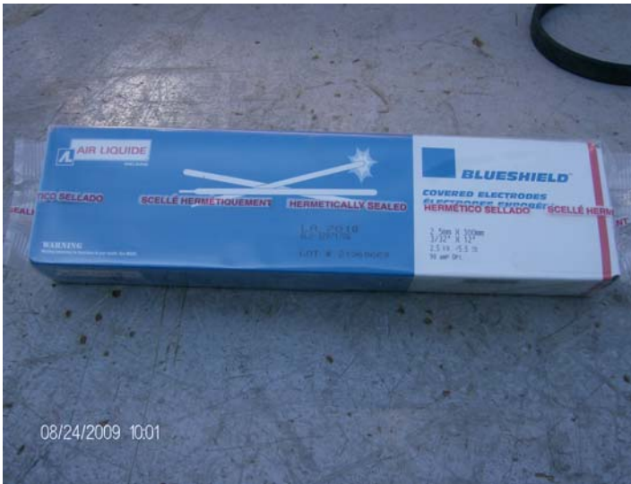
Grand Forks FWKO (A0210632) _7018 welding rods