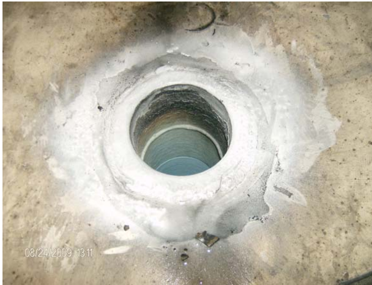
Grand Forks FWKO (A0210632) _ West Nozzle_Final Pass