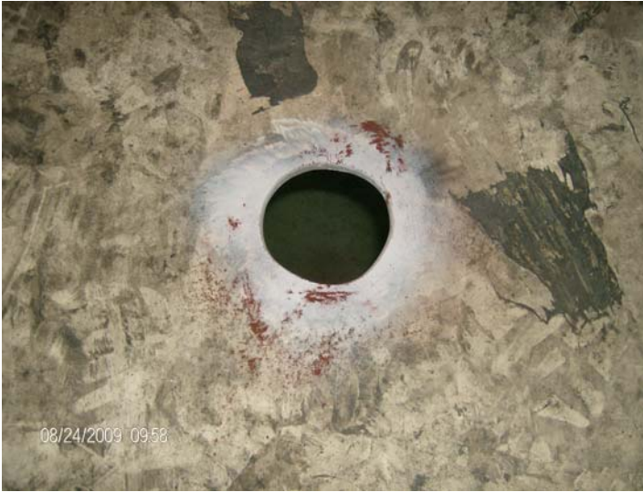
Grand Forks FWKO (A0210632) _ East Nozzle/Internal view opening