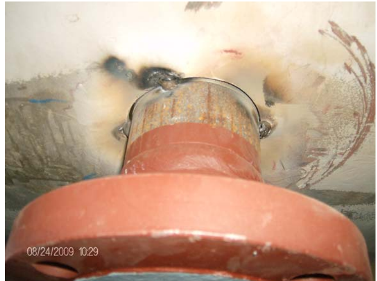
Grand Forks FWKO (A0210632) _East Nozzle_South View of Tack Weld fit up