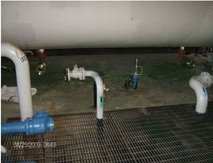
Grand Forks FWKO (A0210632) _ New Nozzles at bottom of vessel