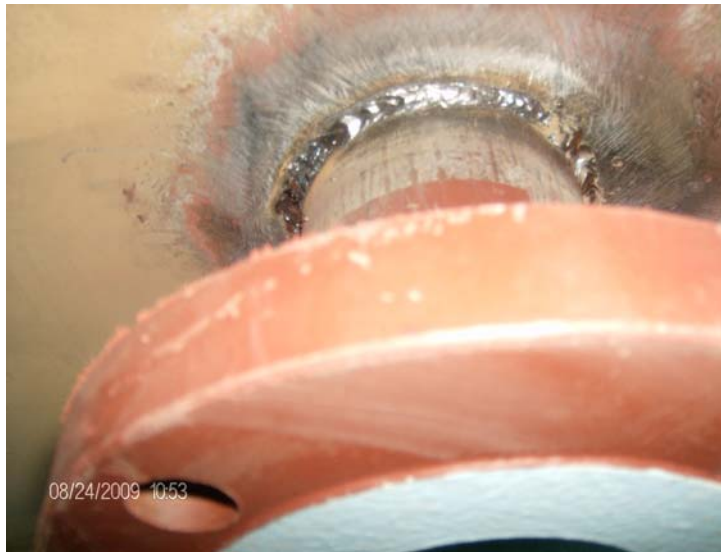
Grand Forks FWKO (A0210632) _ West Nozzle_North View 1 st Pass