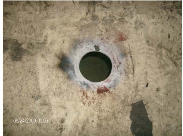
Grand Forks FWKO (A0210632) _ West Nozzle/Internal view opening