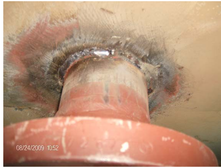
Grand Forks FWKO (A0210632) _ West Nozzle_South View 1 st Pass