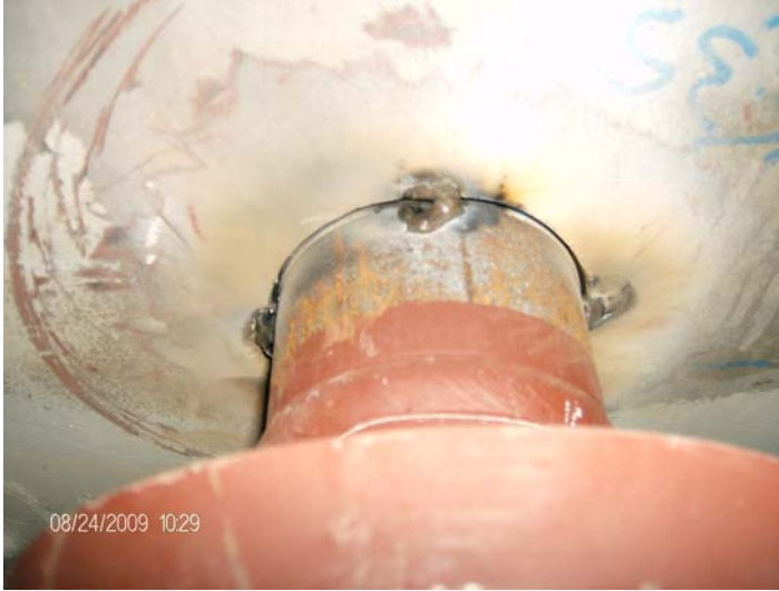
Grand Forks FWKO (A0210632) _ East Nozzle_North View of Tack Weld fit up