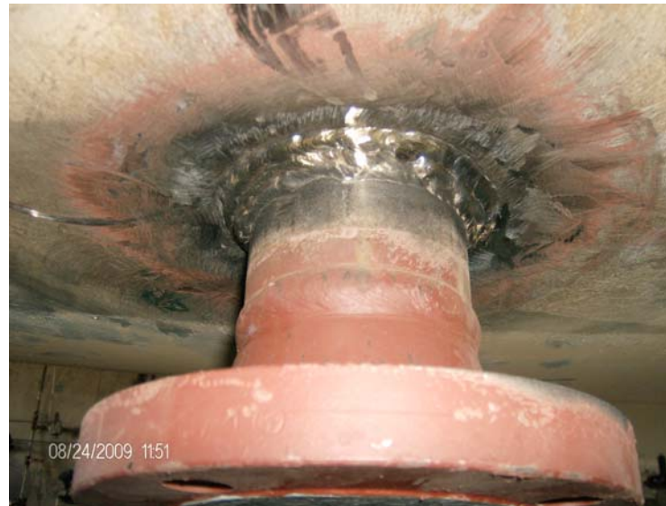
Grand Forks FWKO (A0210632) _ East Nozzle_South View Final Pass