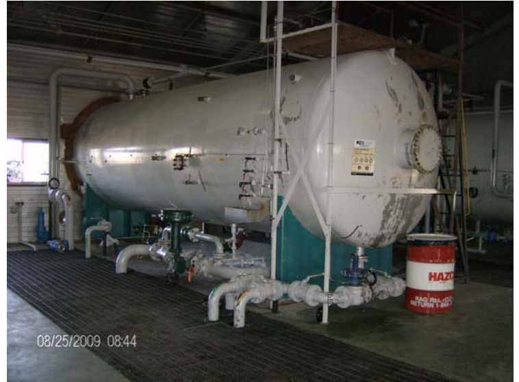
Grand Forks FWKO (A0210632) _ Overview of vessel