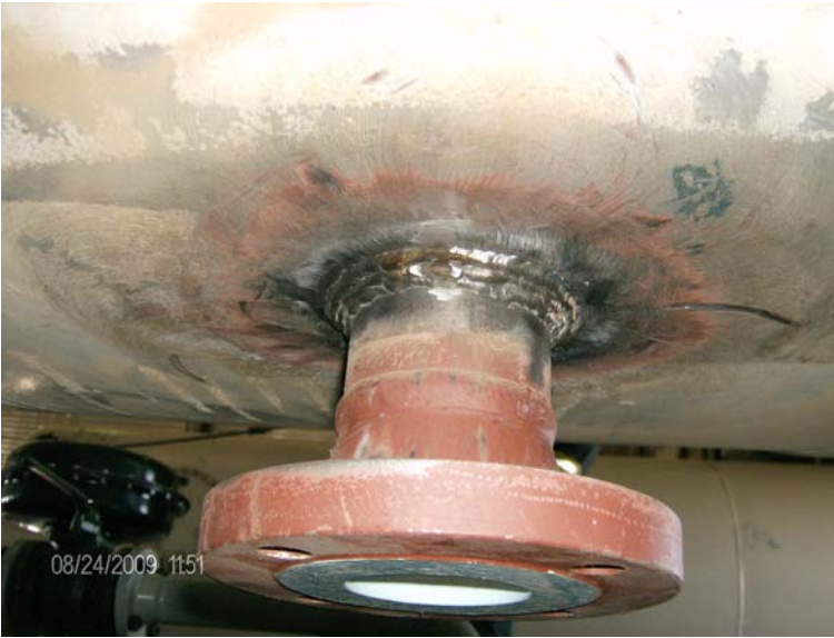
Grand Forks FWKO (A0210632) _ West Nozzle_South View Final Pass