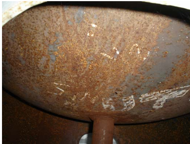
Figure 3_Bottom Head_16April2010

5311 – 86 Street, Edmonton, Alberta T6E 5T8 Phone: (780) 437-2022 Fax: (780) 438-1436