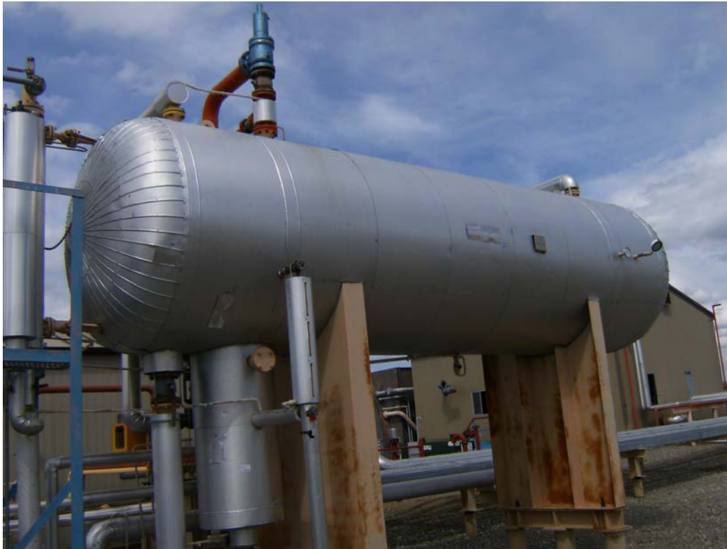
A2791337_External condition of vessel and sump section_20May09