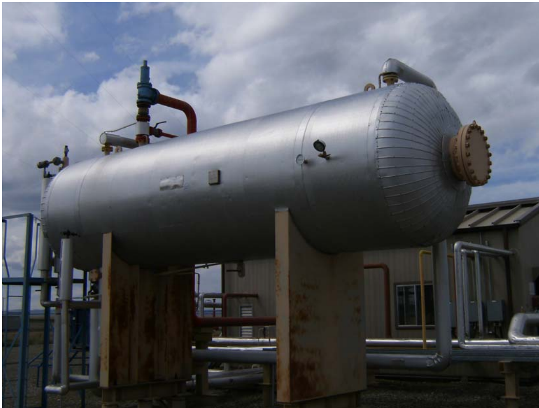
A2791337_vessel external condition_20May09