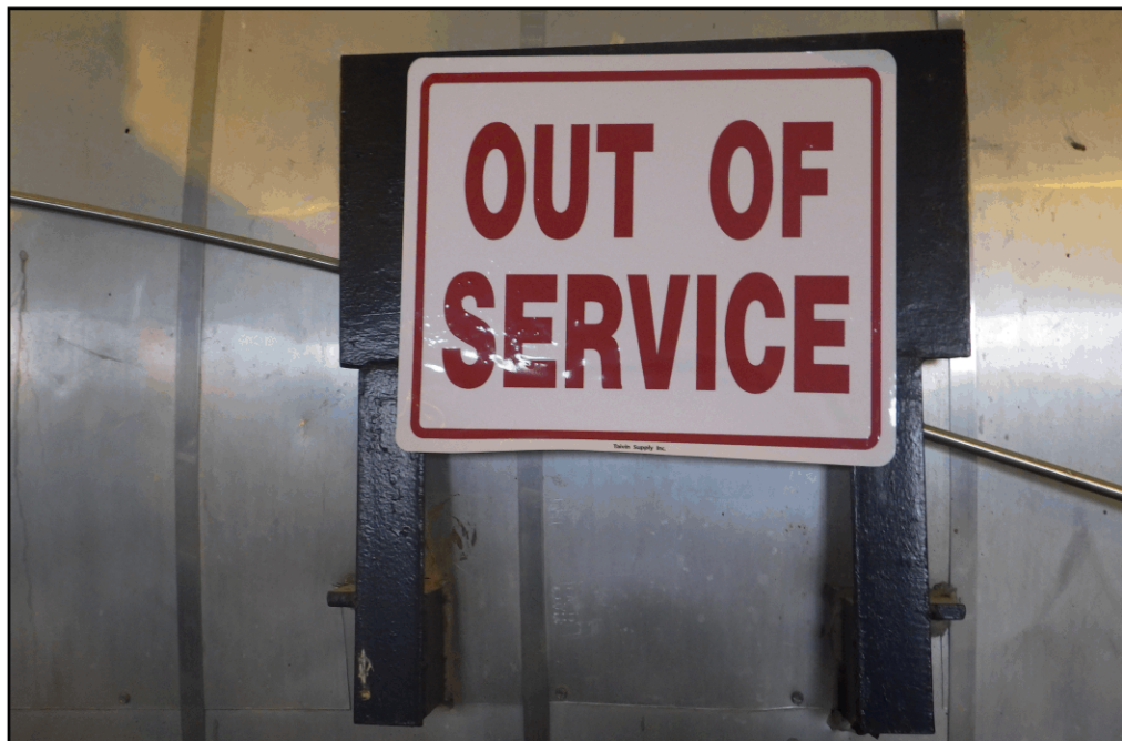
OUT OF SERVICE