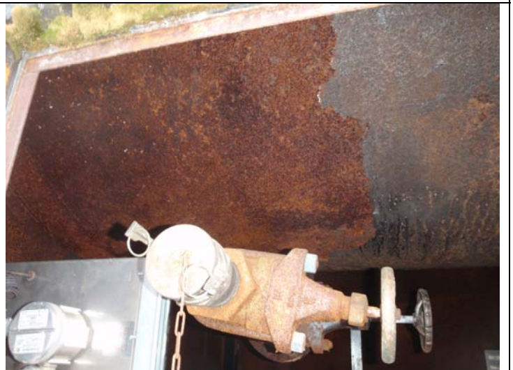
Under belly overview – Paint loss and surface corrosion to 100%